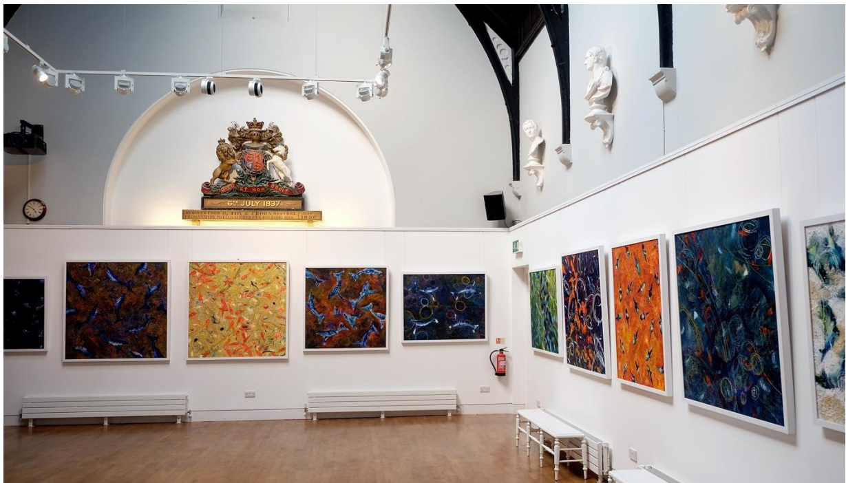
Danny Israel's exhibition, Night Fishing In Ugljan , June 2017.

The Gallery floor area measures 11m x 8m (see Plans below). Three walls of the Gallery are available for mounting art works. The exhibiting area is made up of continuous white-washed panels from the floor to a height of approximately 2.90m (or 2.35m of clear space from the top of the radiators to the hanging rail). An adjustable hanging system using track, cords and hooks will be demonstrated to artists. The suspended lighting system uses new LED light fittings. Artists are very welcome to visit the Gallery to view the facilities.